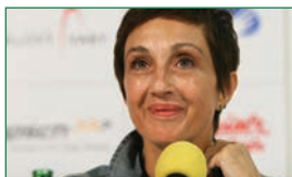
SILVIA MUNT IN THE COMPANY OF WOMEN (SEE P. 23)